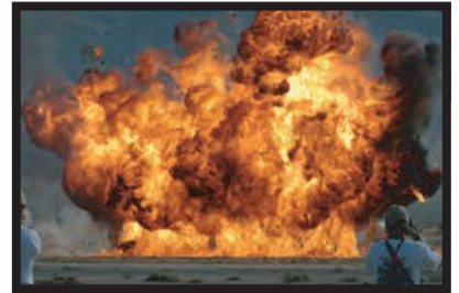
BLAST RESISTANT DOOR UNITS 1.0 psi to 17.7 psi – Seated & Unseated Conditions

Deansteel Manufacturing MULTI-HAZARD RESISTANT units include fire rated ballistic resistant doors. Our blast resistant doors were engineered, built, and tested to 8.7 psi with ballistic resistance up to UL-752 Level 8 and fire resistance up to a 3 hour rating. We are in the process of testing our multi-hazard units to FEMA 320 or 361 requirements in order to apply the certification to our multi-hazard units. These units were conceptually designed to incorporate our diverse accredited product attributes allowing us to offer a multi-hazard resistant product. We are confident that blast resistant capability is a testimony of their extreme wind and impact mitigation capabilities and do not foresee any issues in offering a FEMA 320 and 361 severe storm shelter door unit with bullet, blast, and fire resistant capabilities.