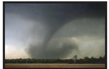
SEVERE STORM SHELTER DOOR UNITS FEMA 361 & 320 and ANSI A250.13

American Made ~ American Owned ~ Buy American