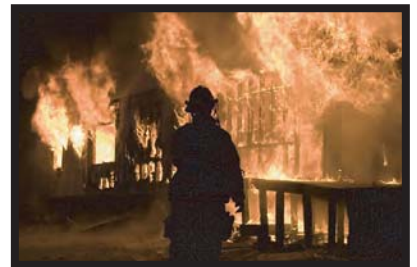
FIRE RESISTANT Underwriters Laboratories – Intertek Testings