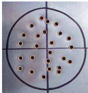
Testing MIL-SAMIT Part 1 - .30 cal 7.62 NATO M80 25 shots in an 8-inch circle